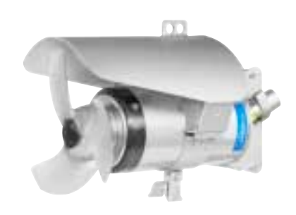
Vortex protection shield