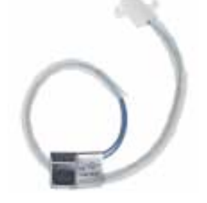
Stator leakage sensor

Provides extra corrosion-resistance for seawater applications.