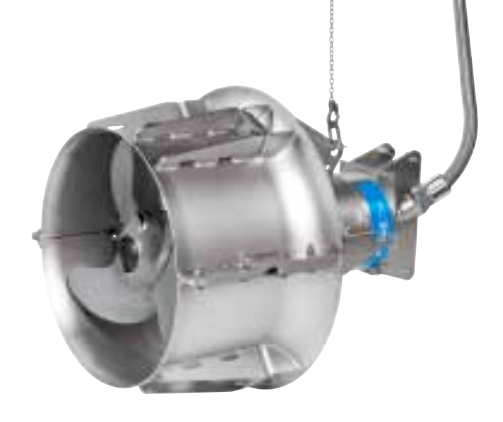
Extended jet ring