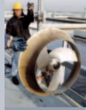
Advantages of Flygt compact mixers