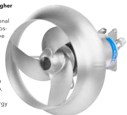
Optional jet ring for increased mixing efficiency.

With the optional jet ring, it is possible to achieve an increase in mixer efficiency by up to 15% in water - and even higher in viscous media, while further reducing energy consumption.