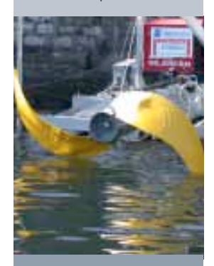
Our comprehensive mixing portfolio

Flygt's wide array of reliable, trouble-free mixing equipment includes: