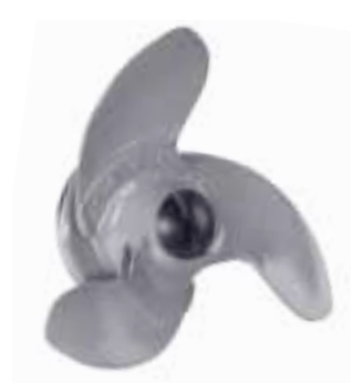
Cast iron propeller